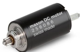
Figure 5: RE 10 DC-Motor