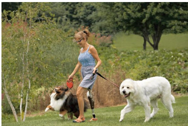
Figure 3: C-Leg® puts the joy back in walking.