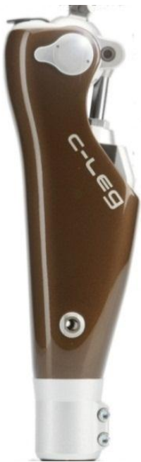
Figure 2: The C-Leg® is an intelligent leg prosthesis that adapts to the gait of its user.

How exactly does the C-Leg® technology work? The intelligent controller of the prosthetic system adapts to the individual gait of each individual. The control operations are performed via a microprocessor-controlled hydraulic unit that dynamically adjusts the system to all gait speeds. Simultaneously the controller ensures that the prosthesis is reliably secured during the stance phase. This tried-and-tested control mechanism is achieved by means of a complex sensor system. The sensors record the load every 0.02 seconds, or, to be more precise, the sensors measure the ankle moments above the foot fitting component, as well as the angle and angle speed of the knee joint. Thus the knee joint permanently detects the current gait phase of the prosthesis wearer. A lithium ion battery powers the C-Leg® and lasts approximately 48 hours.