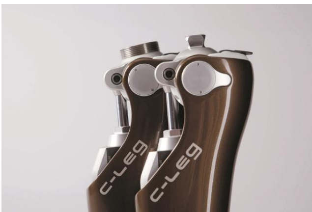
Figure 4: On the new C-Leg®, diverse mechanical and electronic adjustments allow improved swing phase control.